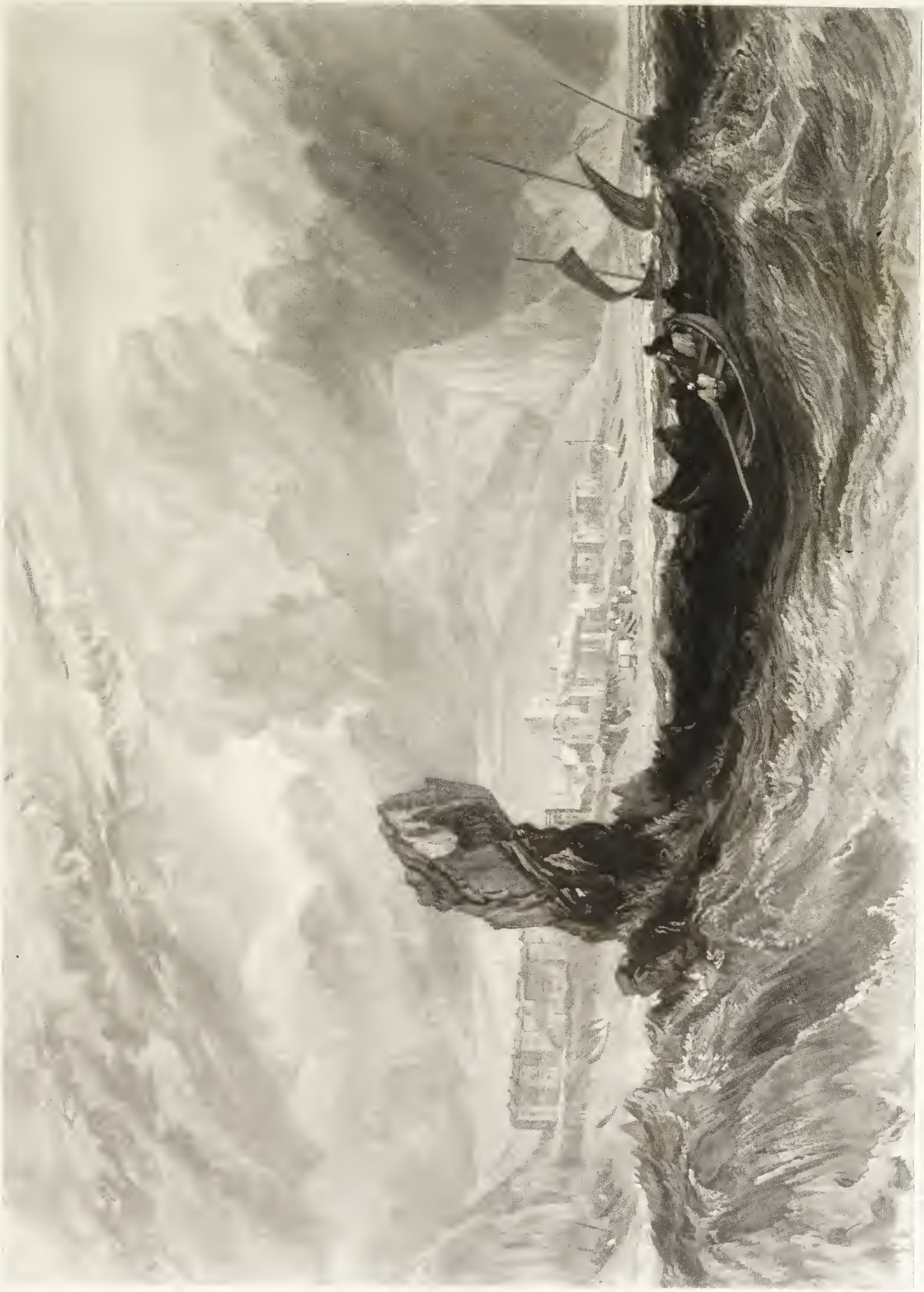
VIEW OF THE TOWN OF ...